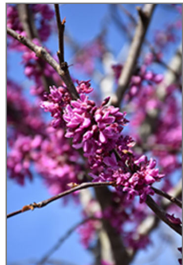
Eastern Redbud (tree form) flowers