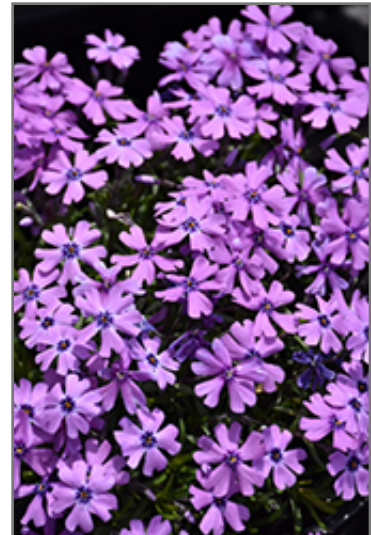
Purple Beauty Moss Phlox flowers

This plant will require occasional maintenance and upkeep, and should only be pruned after flowering to avoid removing any of the current season's flowers. Deer don't particularly care for this plant and will usually leave it alone in favor of tastier treats. Gardeners should be aware of the following characteristic(s) that may warrant special consideration;