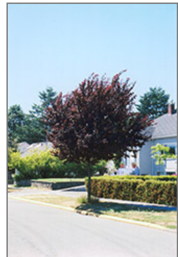
Newport Plum