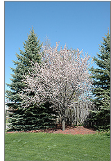
Newport Plum in bloom

This tree should only be grown in full sunlight. It does best in average to evenly moist conditions, but will not tolerate standing water. It is not particular as to soil type or pH. It is highly tolerant of urban pollution and will even thrive in inner city environments. This is a selected variety of a species not originally from North America.