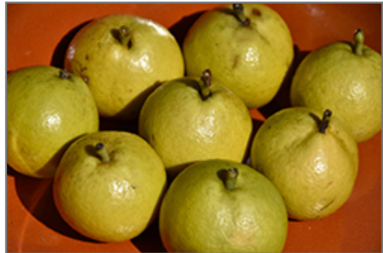
Golden Spice Pear fruit