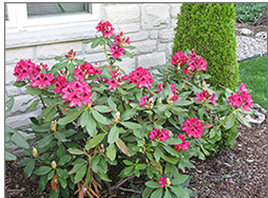
Nova Zembla Rhododendron in bloom