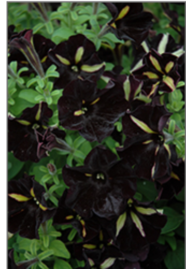
Phantom Petunia flowers