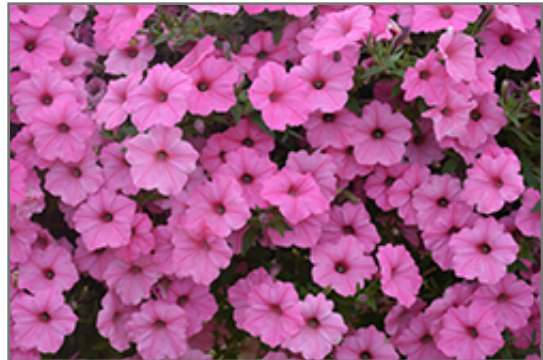
Supertunia Vista Bubblegum Petunia flowers

Supertunia Vista Bubblegum Petunia is recommended for the following landscape applications;