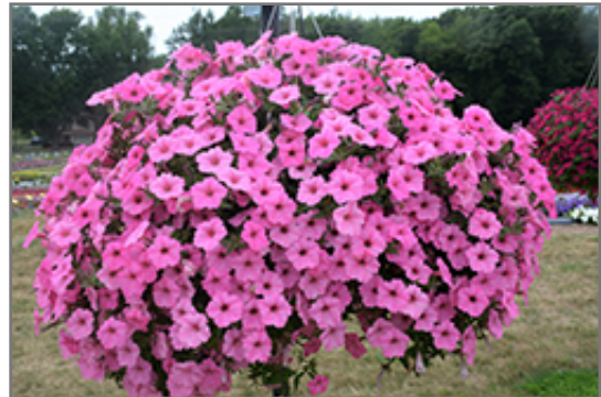
Supertunia Vista Bubblegum Petunia in bloom

Supertunia Vista Bubblegum Petunia will grow to be about 18 inches tall at maturity, with a spread of 24 inches. When grown in masses or used as a bedding plant, individual plants should be spaced approximately 20 inches apart. Its foliage tends to remain dense right to the ground, not requiring facer plants in front. This fast-growing annual will normally live for one full growing season, needing replacement the following year.