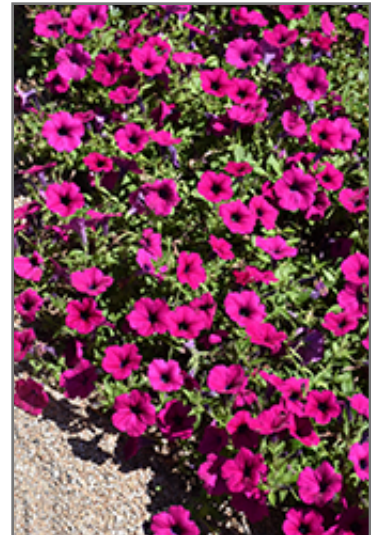
Wave Purple Classic Petunia flowers

Wave Purple Classic Petunia is recommended for the following landscape applications;