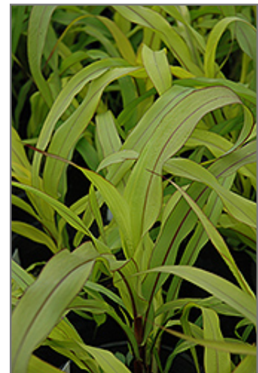
Jester Millet foliage