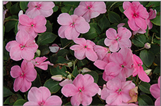
Super Elfin XP Pink Impatiens flowers

Super Elfin XP Pink Impatiens is recommended for the following landscape applications;