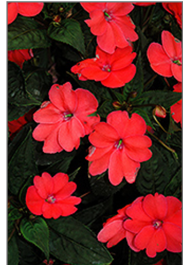
SunPatiens Compact Coral New Guinea Impatiens flowers

SunPatiens Compact Coral New Guinea Impatiens is recommended for the following landscape applications;