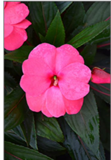
Sonic Pink New Guinea Impatiens flowers

Sonic Pink New Guinea Impatiens is recommended for the following landscape applications;