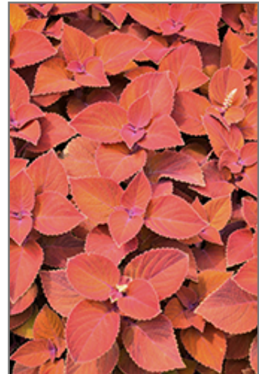
ColorBlaze Sedona Sunset Coleus foliage