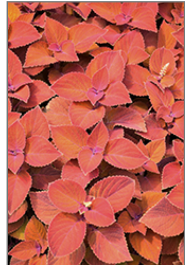
ColorBlaze Sedona Sunset Coleus foliage