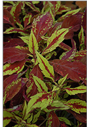
Pineapple Coleus foliage