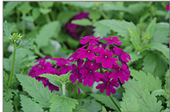
Superbena Purple Verbena flowers

Superbena Purple Verbena is recommended for the following landscape applications;