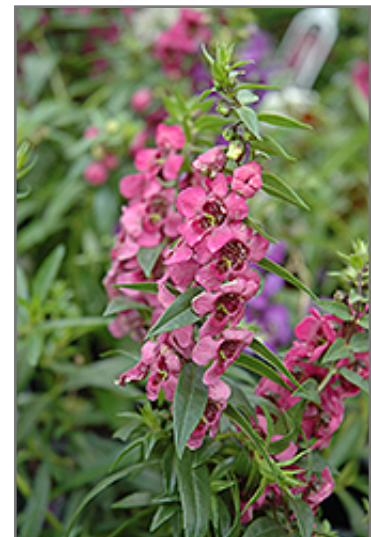
Pink Angelonia flowers