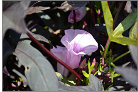
Sidekick Black Sweet Potato Vine flowers

This plant does best in full sun to partial shade. You may want to keep it away from hot, dry locations that receive direct afternoon sun or which get reflected sunlight, such as against the south side of a white wall. It does best in average to evenly moist conditions, but will not tolerate standing water. It is not particular as to soil type or pH. It is somewhat tolerant of urban pollution. This is a selected variety of a species not originally from North America. It can be propagated by cuttings; however, as a cultivated variety, be aware that it may be subject to certain restrictions or prohibitions on propagation.