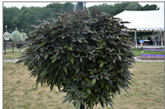
Sidekick Black Sweet Potato Vine