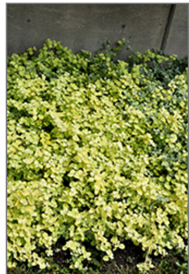
Lemon Licorice Plant