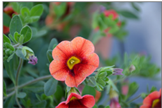
Celebration Mandarin Calibrachoa flowers