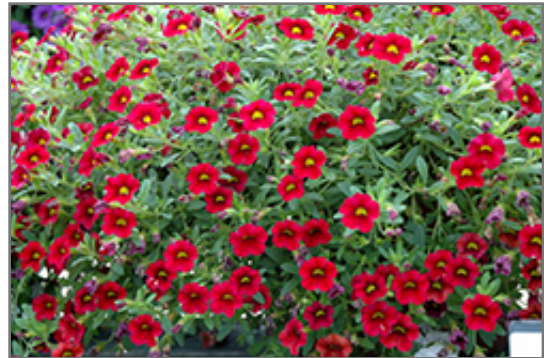
MiniFamous Compact Dark Red Calibrachoa flowers

MiniFamous Compact Dark Red Calibrachoa is recommended for the following landscape applications;