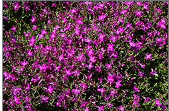
Techno Violet Lobelia flowers

Techno Violet Lobelia is a fine choice for the garden, but it is also a good selection for planting in hanging baskets. Because of its trailing habit of growth, it is ideally suited for use as a 'spiller' in the 'spiller-thriller-filler' container combination; plant it near the edges where it can spill gracefully over the pot. Note that when growing plants in outdoor containers and baskets, they may require more frequent waterings than they would in the yard or garden.