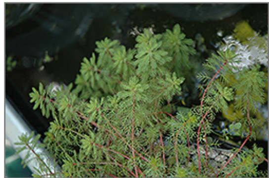
Red Stemmed Parrot Feather foliage