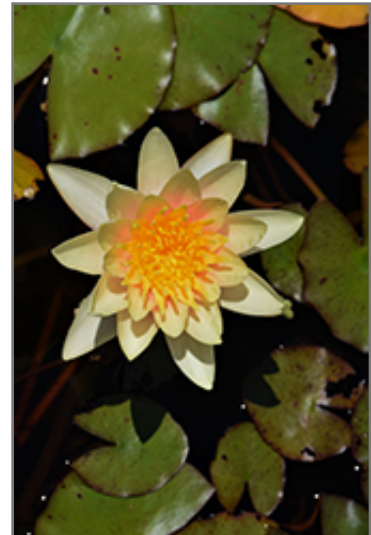
Comanche Hardy Water Lily flowers

Comanche Hardy Water Lily is recommended for the following landscape applications;