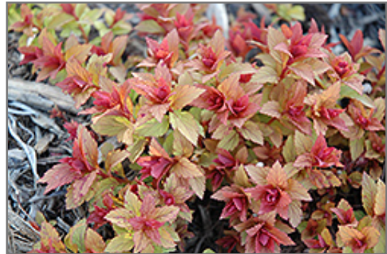
Magic Carpet Spirea foliage