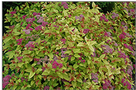
Magic Carpet Spirea flowers