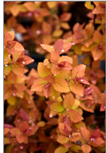
Double Play Big Bang Spirea foliage

This shrub should only be grown in full sunlight. It prefers to grow in average to moist conditions, and shouldn't be allowed to dry out. It is not particular as to soil type or pH. It is highly tolerant of urban pollution and will even thrive in inner city environments. This particular variety is an interspecific hybrid.