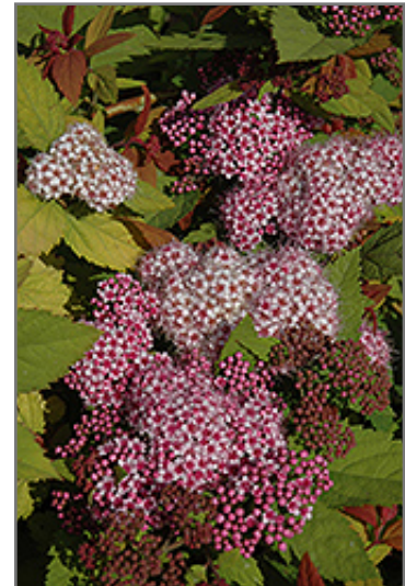
Double Play Big Bang Spirea flowers

This shrub will require occasional maintenance and upkeep, and is best pruned in late winter once the threat of extreme cold has passed. It is a good choice for attracting butterflies to your yard, but is not particularly attractive to deer who tend to leave it alone in favor of tastier treats. It has no significant negative characteristics.