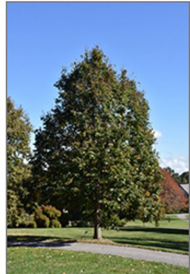
Redmond Linden