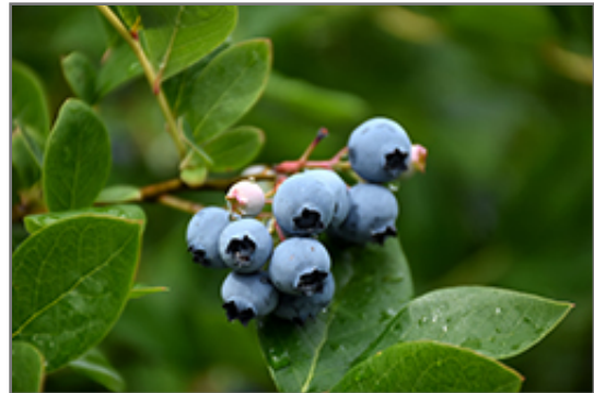
Northcountry Blueberry fruit

Northcountry Blueberry features dainty clusters of white bell-shaped flowers with shell pink overtones hanging below the branches in mid spring. It has green deciduous foliage. The glossy oval leaves turn an outstanding scarlet in the fall. It features an abundance of magnificent blue berries in mid summer.