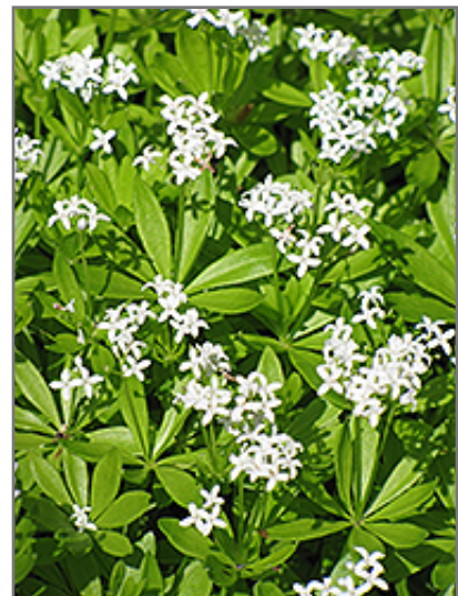
Sweet Woodruff flowers