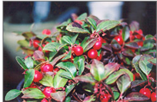
Creeping Wintergreen fruit

This is a relatively low maintenance shrub, and should not require much pruning, except when necessary, such as to remove dieback. Deer don't particularly care for this plant and will usually leave it alone in favor of tastier treats. Gardeners should be aware of the following characteristic(s) that may warrant special consideration;