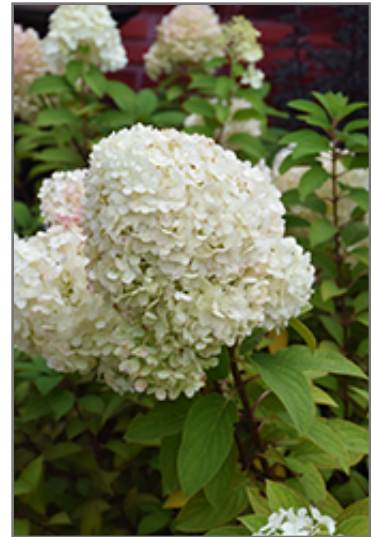
Bobo Hydrangea flowers