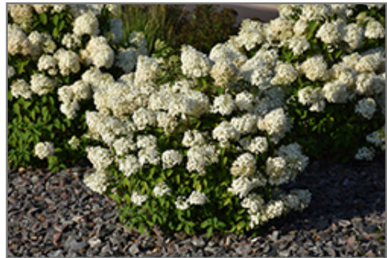
Bobo Hydrangea in bloom