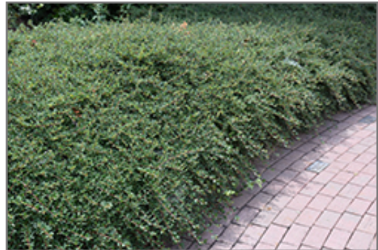
Coral Beauty Cotoneaster

Coral Beauty Cotoneaster is a multi-stemmed evergreen shrub with a shapely form and gracefully arching branches. It lends an extremely fine and delicate texture to the landscape composition which should be used to full effect.