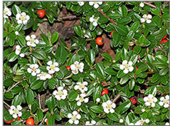
Coral Beauty Cotoneaster fruit