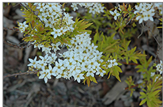
Mellow Yellow Spirea flowers