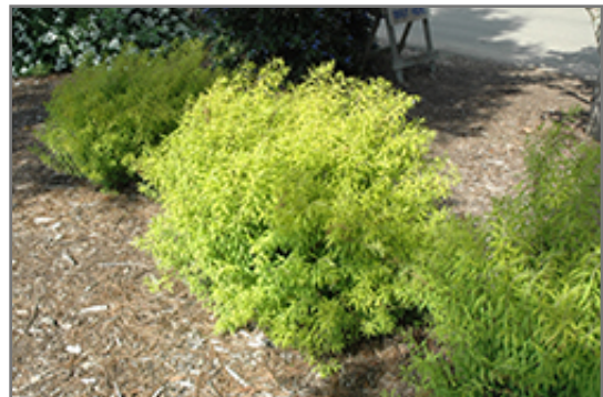
Mellow Yellow Spirea

This is a high maintenance shrub that will require regular care and upkeep, and should only be pruned after flowering to avoid removing any of the current season's flowers. It is a good choice for attracting butterflies to your yard, but is not particularly attractive to deer who tend to leave it alone in favor of tastier treats. It has no significant negative characteristics.