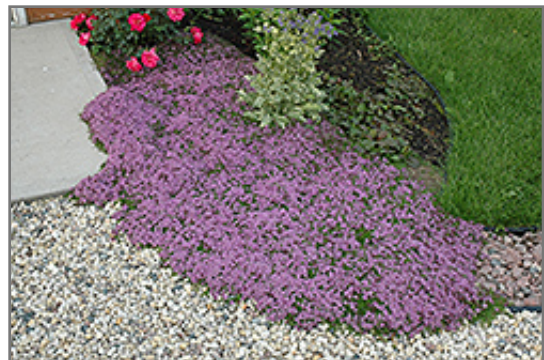
Red Creeping Thyme in bloom