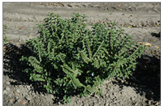
Pucker Up Red Twig Dogwood