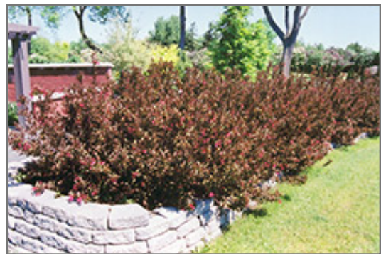
Wine and Roses Weigela