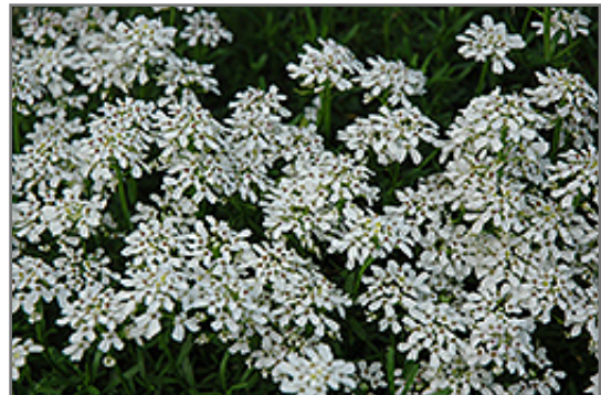
Little Gem Candytuft flowers