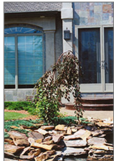
Royal Beauty Flowering Crab