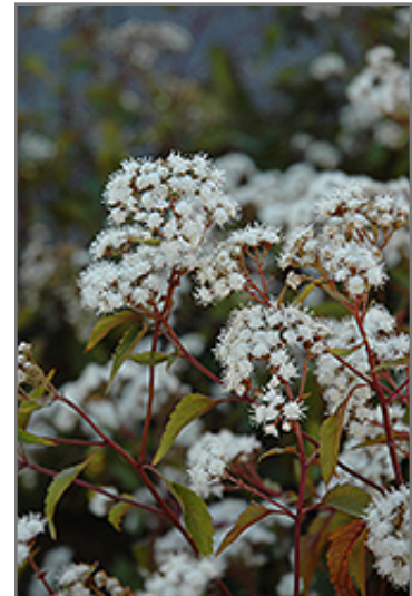
Chocolate Boneset flowers

This is a relatively low maintenance plant, and is best cleaned up in early spring before it resumes active growth for the season. It is a good choice for attracting butterflies to your yard, but is not particularly attractive to deer who tend to leave it alone in favor of tastier treats. It has no significant negative characteristics.