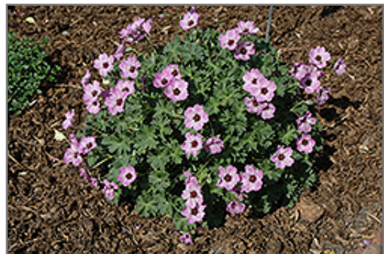
Ballerina Cranesbill flowers