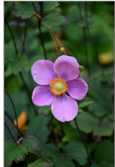
Lucky Charm Anemone flowers

Lucky Charm Anemone is recommended for the following landscape applications;