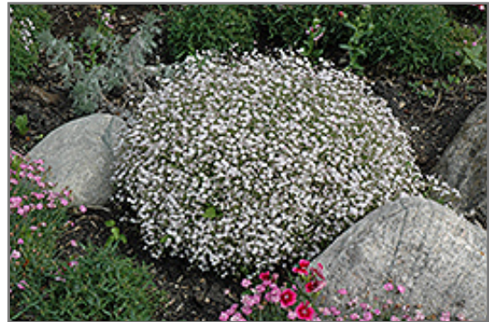
Creeping Baby's Breath in bloom

Creeping Baby's Breath is recommended for the following landscape applications;