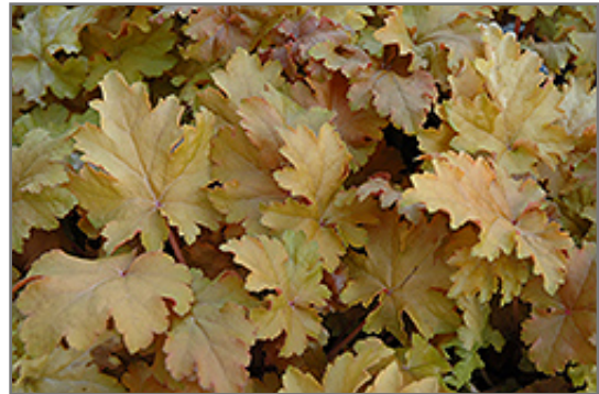
Amber Waves Coral Bells foliage