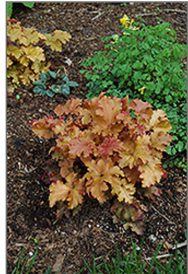
Amber Waves Coral Bells

Amber Waves Coral Bells is a dense herbaceous evergreen perennial with tall flower stalks held atop a low mound of foliage. Its relatively fine texture sets it apart from other garden plants with less refined foliage.