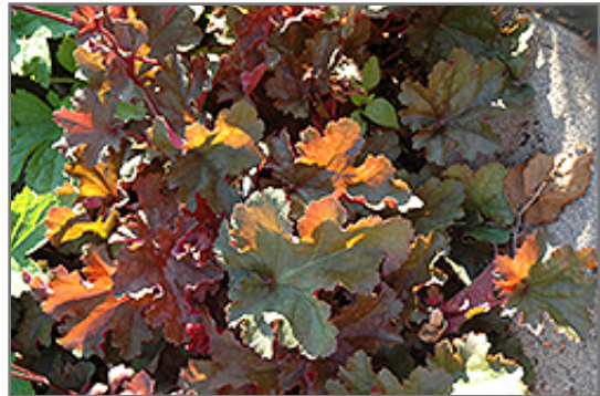
Chocolate Ruffles Coral Bells foliage