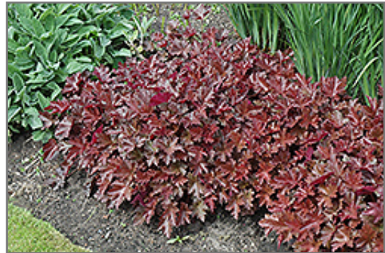
Chocolate Ruffles Coral Bells

Chocolate Ruffles Coral Bells is a dense herbaceous evergreen perennial with tall flower stalks held atop a low mound of foliage. Its relatively fine texture sets it apart from other garden plants with less refined foliage.