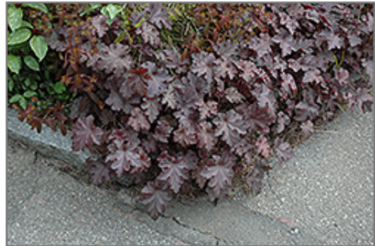
Stormy Seas Coral Bells

Stormy Seas Coral Bells is recommended for the following landscape applications;