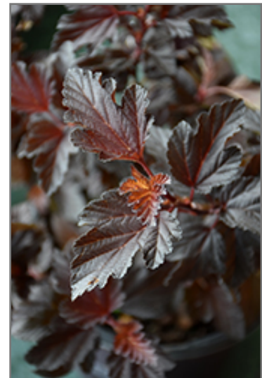
Fireside Ninebark flowers