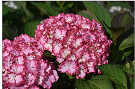
Seaside Serenade Fire Island Hydrangea flowers

Seaside Serenade Fire Island Hydrangea is a multi-stemmed deciduous shrub with a more or less rounded form. Its relatively coarse texture can be used to stand it apart from other landscape plants with finer foliage.