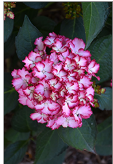
Seaside Serenade Fire Island Hydrangea flowers