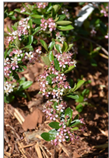
Ground Hug Aronia flowers