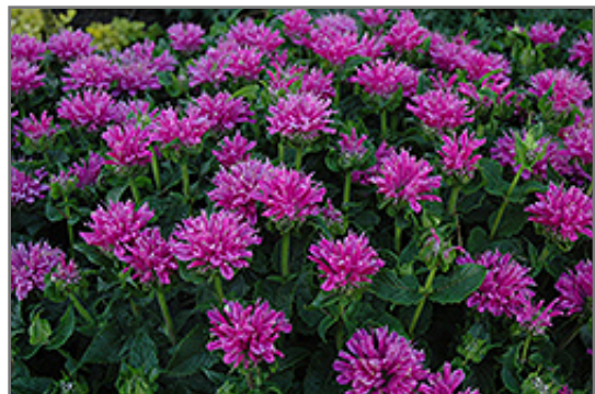
Petite Delight Beebalm flowers