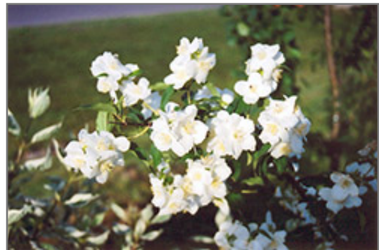
Lewis' Mockorange flowers