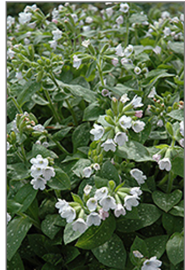
Sissinghurst White Lungwort flowers